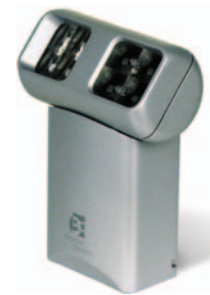
Example of NorthStar IR Projector